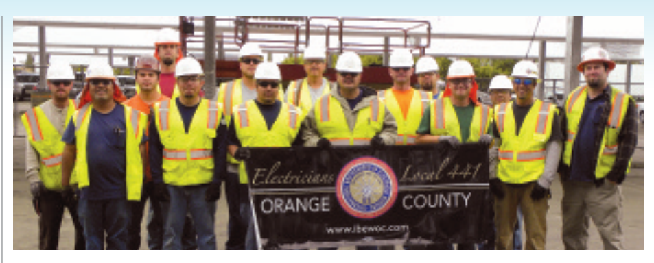
Local 441 Rosendin Electric crew at the Orange County Operations Facility job site in Santa Ana, CA.