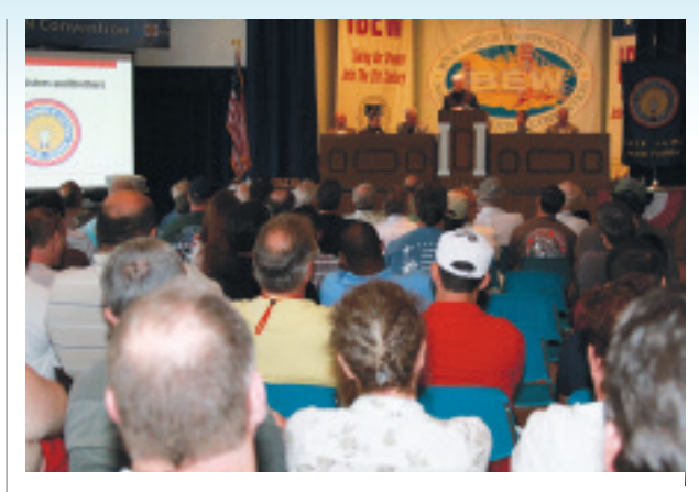
South Florida members attend IBEW Town Hall meeting held at Miami Local 349.

More than 500 IBEW members from 14 south Florida IBEW locals participated in the Miami meet-