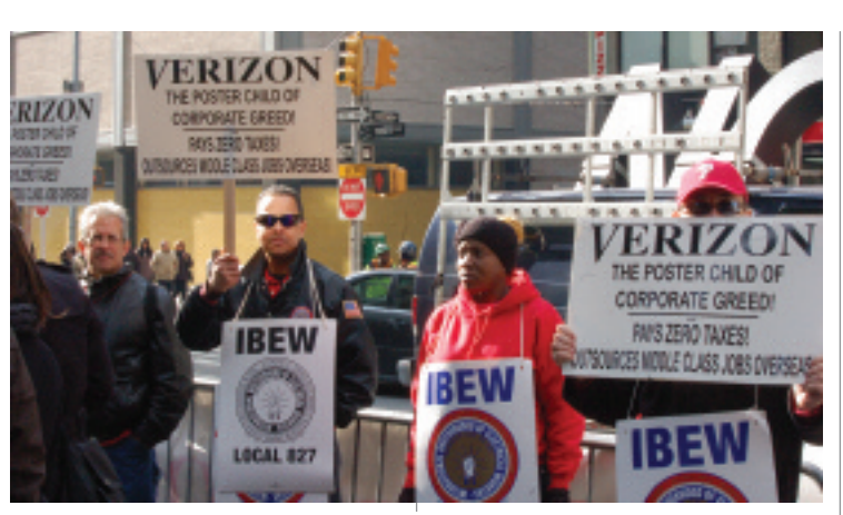
Verizon Communications Corp. is looking to slash more than 2,000 landline jobs across the country, threatening build-out of high-speed broadband.

Negotiations between the telecommunications giant and the IBEW and