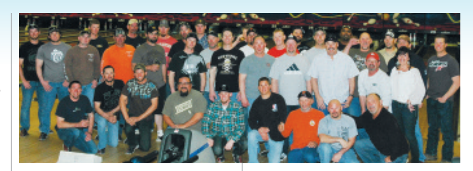
Members from Turlock Irrigation District and Modesto Irrigation District faced off in a bowling showdown. A few members from City of Lodi and PG&E joined in the fun. A Turlock team won top prize: a monogrammed set of IBEW Local 1245 poker chips.

ticeship and meeting their goals through education. The keys to the successful education of our members are strength and dedication—which have led the RGV-Laredo/JATC graduates to this day of a new career in the electrical industry. We look forward to continue educating and training electricians seeking to utilize the opportunities for learning and working as highly qualified electrical workers.