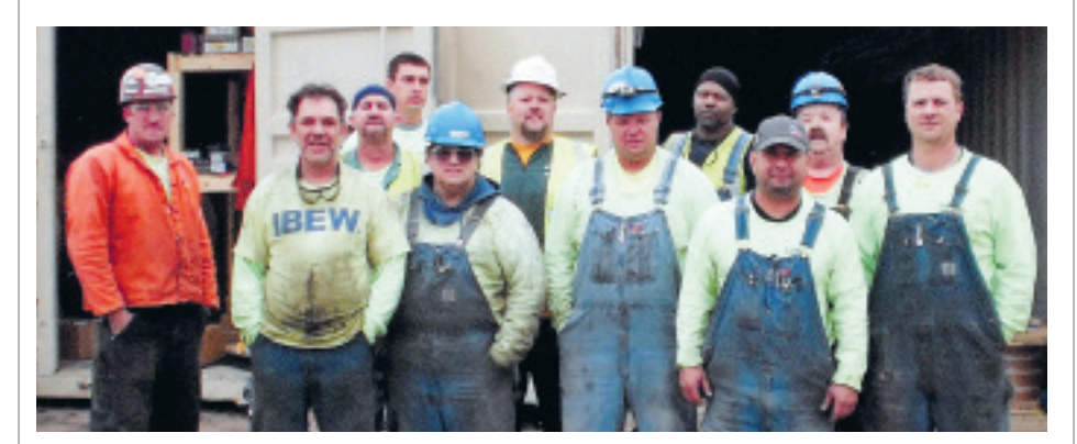
IBEW members from Local 553 and Local 8 in a joint venture on Laibe Electric project at Verallia glass plant project.