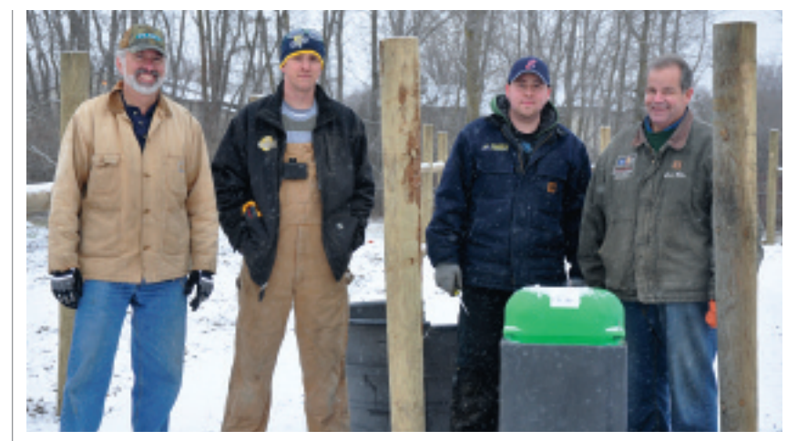
Lansing Local 665 apprentices helped install an automatic horse watering system at a therapeutic riding center.

The riding facility is part of the Marvin E. Beekman Center, a program