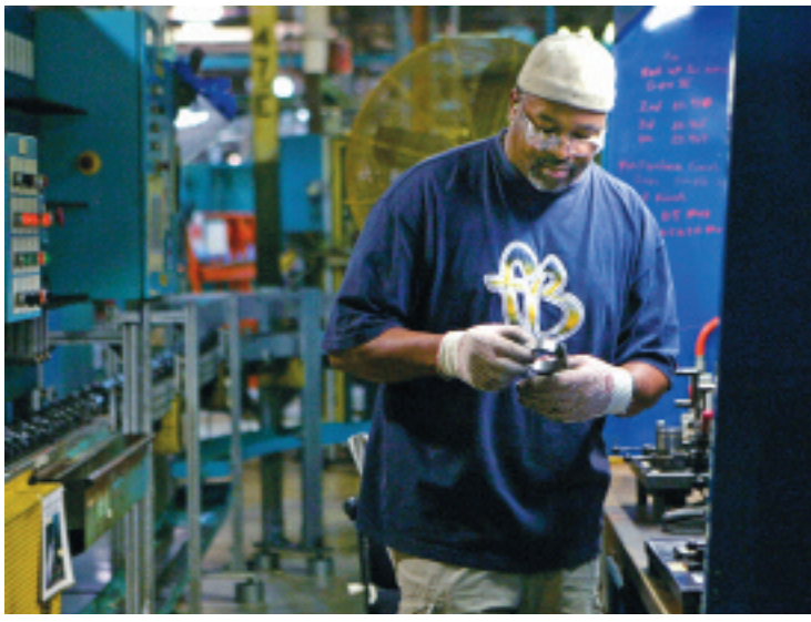
General Motors Corp. announced that it was investing $20 million in the Powertrain plant in Bay City, Mich., to produce energy-efficient engines.

"The restructuring has paid big dividends for the nation, autoworkers and the domestic auto industry," writes Economic